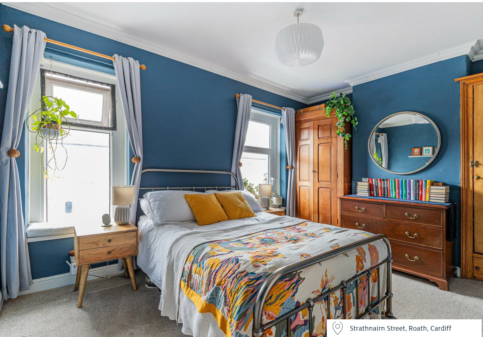
Strathnairn Street, Roath, Cardiff